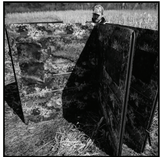
STEP 2: Un-fold the accordion style panel folding frame and situate into a hexagonal shape. Attach the two ends with the integrated straps.