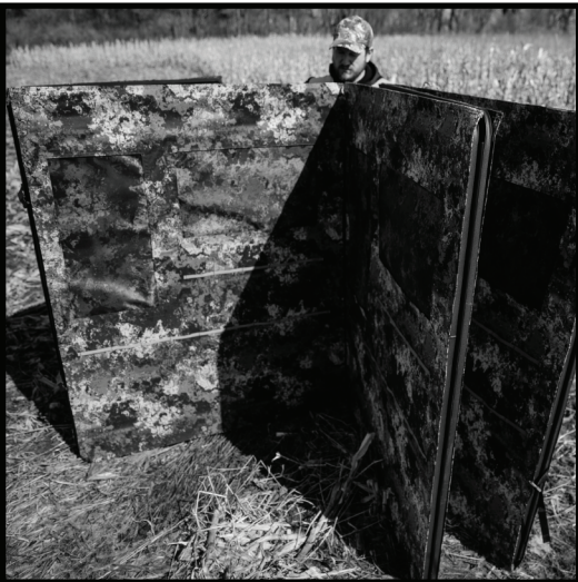
STEP 3: Unattach the straps on end panels. Fold panels in an accordion style pattern