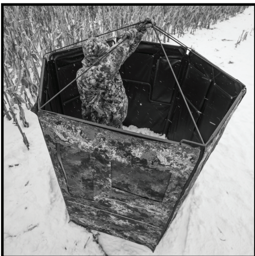
STEP 3: Insert the powder coated steel struts through the designated holes in the frame.