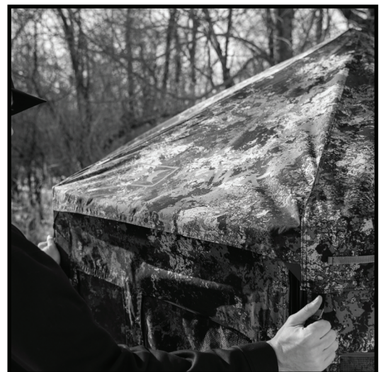
STEP 4: Attach the roof over the struts.