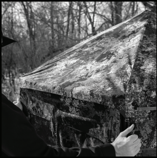
STEP 1: Detach and remove roof from struts.